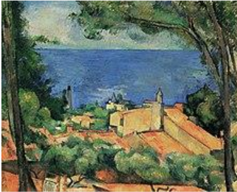
'The Estaque Peninsula with red roofs,' by Paul Cézanne.jpg

Pauwels Travel Bureau Ltd. 15 Egerton Street Brantford, Ont. N3T 4P6 Tel: 519-753-2695/800-380-3974 - Fax: 519-753-6376 tours@pauwelstravel.com – www.pauwelstravel.com