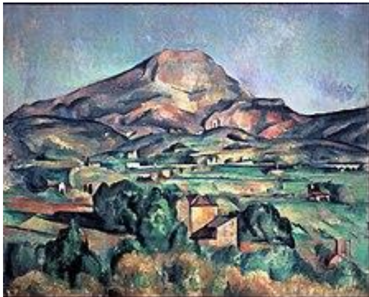
< Montagne Sainte-Victoire on a painting by Cézanne

chateau in this village and is buried here. On to the charming historical capital of Provence, which was once an independent kingdom: Aix-en-Provence. Upon arrival, leisurely walking tour of the medieval city centre, with highlights the Cathedral and the magnificent plane tree-lined boulevard known as the Cours Mirabeau. After a break for lunch, visit to Cézanne's workshop before we drive south to the beautiful Mediterranean seaside resort of La Ciotat, the comfortable 3-star Hotel Plage Saint-Jean ( https://www.hotelplagestjean.com/en ), located at a stone's throw from the beach. How about a swim in the hotel's indoor pool before our group dinner this evening?