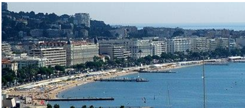
Cannes: Hotels along La Croisette and the beach

Day 3 – Thursday, October 12: After breakfast, exploration of Grasse, with a guided tour of one of the numerous local perfume manufacturers. On to Cannes for a sightseeing tour, by little tourist train, of the old town and the waterfront boulevard, La Croisette, backdrop of the city’s annual movie festival. After lunch we head for nearby Antibes, founded by the ancient Greeks, where we view the monument commemorating Napoleon’s return from exile on the island of Elba and visit the local museum focused on the work of Picasso, who lived for many years in this area; the Picasso Museum occupies the site of the Greek acropolis, which became a Roman and then a medieval fortress belonging to the Grimaldis, a famous Genoese family whose descendants still rule Monaco. Return to our hotel in late afternoon and free evening.