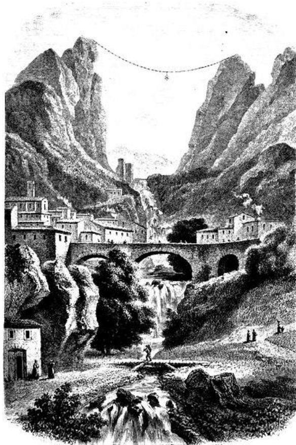
Verdon, canyon, Verdon

Day 6 - Sunday, October 15: A full day to experience the absolutely breathtaking scenery of the Gorges du the “Grand Canyon” of France and Europe’s biggest carved out of the rocky Provençal highlands by the River, with cliffs that rise as high as 700m! We will leisurely tour the northern as well as the southern rim, pausing regularly for photo opportunities, and for coffee breaks and lunch in quaint towns and villages such as Castellane and Aiguines, where the Verdon River widens into a big blue lake, the Lac de Sainte-Croix. Return to Moustiers in late afternoon, and rest of the day at leisure.