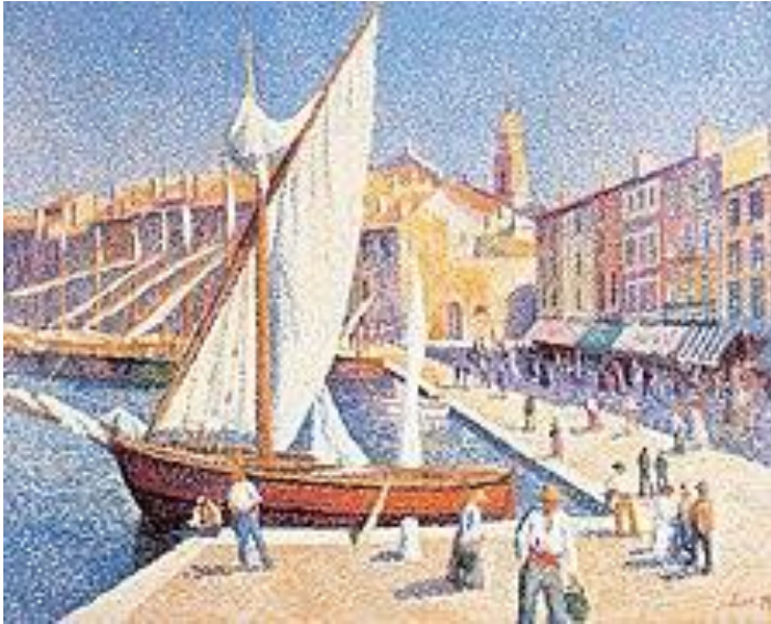
The port of Saint-Tropez, by Maximilien Luce (1893)