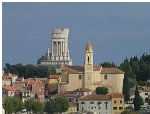
The Trophy of the Alps at La Turbie

Day 4 – Friday, October 13: Full-day excursion along the French Riviera, a.k.a. the Côte d’Azur. The most beautiful and interesting stretch, between Nice, the “queen city” of this playground, to the Italian border, involves three spectacular scenic routes known as Corniches. We start out along the Lower Corniche, a stunning drive along the coast all the way to Menton, the last town before the border. En route we will pay a visit to the Principality of Monaco, with the old town and the Prince’s Palace as well as the Monte Carlo district with its famous Casino. Return via a stretch of the Grande Corniche, the high mountain road. In the village of La Turbie, an impressive monument, known as the “Trophy of the Alps,” was erected by the Romans to celebrate their conquest of this southern part of Gaul, as France was known then, turning it into a province of their empire, hence the name Provence. It was here that a major Roman road entered Gaul, an extension of the famous Via Aurelia, but known locally as the Via Julia Augusta. Descending to the level of the Middle Corniche, we enjoy spectacular views of the Mediterranean coast as we head for Nice for a panoramic tour of this magnificent city, including its old town as well as the world-famous waterfront boulevard, the Promenade des Anglais. Return to our hotel in the early evening. Today, group lunch or dinner .