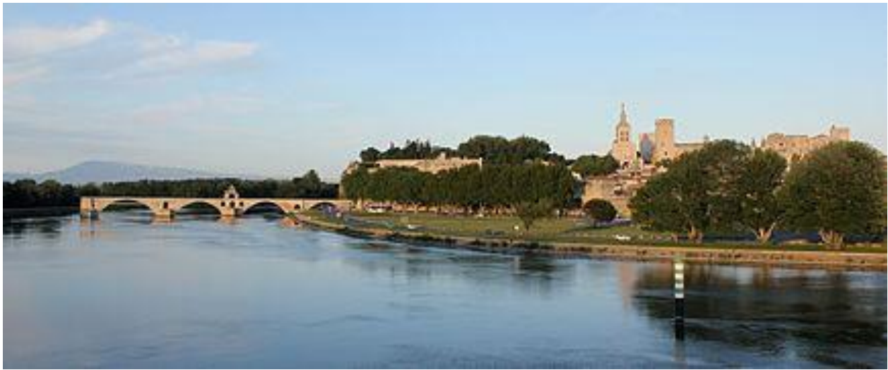
Panoramic view of Avignon and its famous bridge

Day 15 – Tuesday, October 24: After breakfast, transfer to Marseille Airport in time for the Lufthansa return flights Frankfurt and Toronto. Departure from Marseille at 1045AM and arrival in Toronto at 4:20PM.